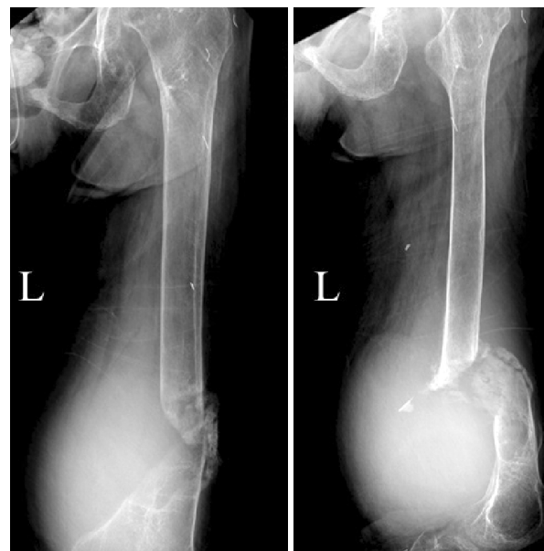
Fig. 2. Anteroposterior and lateral radiographs at one year follow-up. Non-union is shown along with a large gap and bony resorption at the fracture site and a large soft tissue shadow on the posterior compartment is shown.

The patient was referred to vascular surgeon and underwent surgical exploration, aneurysmectomy, and popliteal angioplasty. Internal fixation of fracture site could be not performed due to inadequate bone stock for rigid fixation and high morbidity expected after bone surgery. An incision was made along the marked line through the course of the popliteal artery over the pseudoaneurysm to block the femoral arterial forward and backward flow. After clamping the femoral artery and popliteal artery, the pseudoaneurysm was resected and was deemed to originate at the site of a defect on the arterial wall of popliteal artery (Fig. 4A). Finally, angioplasty was performed directly by an oblique resection of the defect margin (Fig. 4B). Anticoagulation therapy