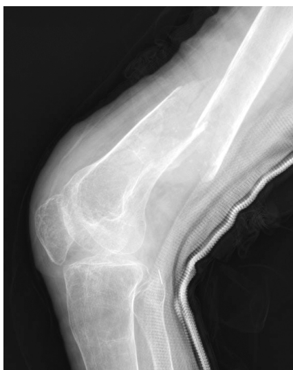
Fig. 1. Lateral radiograph of the left femur in a 60-year-old female showing a distal femur fracture and severe disuse osteoporosis.

Beside bilateral lower extremity paralysis, she also had tuberculosis-destroyed kidney resulted in chronic renal failure relying on hemodialysis. She had the history of chronic tuberculosis and secondary bacterial infection around urinary tract and psoas muscle area additionally. Due to her chronic medical conditions including chronic renal failure on hemodialysis and latent and recurrent tuberculosis infection and to low functional demand of lower extremity from bilateral paralysis, conservative treatment with cast after closed reduction was initiated. Immobilization with long leg cast was maintained for 6 weeks. Her periodic follow-up was lost for a while. After eleven months from the trauma, the patient visited again the outpatient clinic with complaint of a tender swelling over the posterior side of left distal thigh; Plain X-ray revealed an ovoid soft tissue shadow (3 cm) behind the fracture site under an impression of residual hematoma. The fracture site had little callus with im-