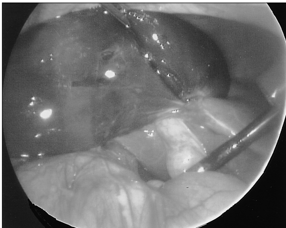
Fig. 2. During the laparoscopic procedure, the gallbladder was markedly distended, hemorrhagic and "floating" away from the liver bed.

the right lower quadrant. No guarding and rebound tenderness were appreciated. An initial complete blood count revealed hemoglobin of 10.1g/dL, hematocrit of 30.3% and white blood cell count of 6,600/ \mu L. Other blood chemistry parameters were unremarkable. Routine chest and abdominal radiographs were also unremarkable. A contrast-enhanced axial CT scan demonstrated a massively distended "floating GB", with a conical structure connecting the GB to the liver (Fig. 1). No stones were identified. A presumptive diagnosis of torsion of the GB was considered,