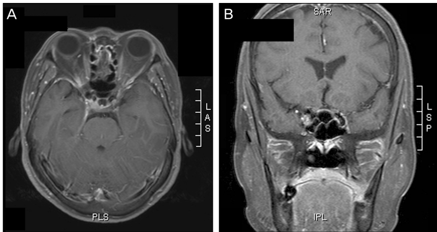
Fig. 1. Gadolinium-enhanced magnetic resonance imaging shows enhancement in the right cavernous sinus in the fat-suppressed T1-weighted axial image (A) and T1-weighted sagittal image (B).