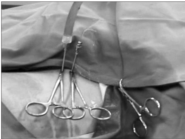
Figure 2. Hip joint irrigation using the two-needle irrigation technique. The left needle supplies sterile saline solution and the right needle drains the irrigated fluid outside the hip joint.

(intermittent temperature 38°C), elevated inflammatory markers (C-reactive protein 12.56 mg/dl, erythrocyte sedimentation rate 105 mm/h) and hip pain still presented. Left hip joint irrigation was carried out again after 2 days, which showed aggravated joint fluid analysis results (WBC 35,000/ \mu l, segmented neutrophil 86%, glucose 3 mg/dl, more turbidity). On this day, the Mycofast test of the joint fluid showed a positive result. Consequently antibiotic treatment was changed to IV lincomycin (500 mg; BID) and oral ciprofloxacin (500 mg; BID) for 2 weeks. The patient recovered an almost normal range of movement of the hip and was discharged with oral antibiotics (clindamycin 150 mg; TID and ciprofloxacin 500 mg; BID for 6 weeks). The relationship between the trend of the patient's inflammatory markers, fever pattern, and antibiotic prescription is shown in Fig. 3.