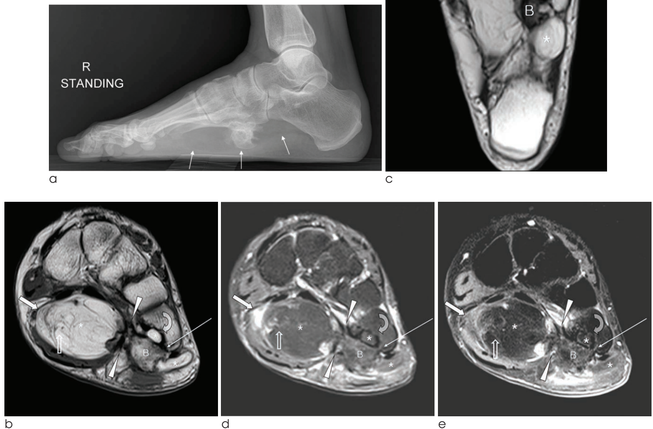
Fig. 1. A 48-year-old female patient with parosteal lipoma in the right foot.

radiograph of the right foot showed an irregular bony protruding lesion from the right 5 th metatarsal base toward the plantar surface, with a surrounding well-circumscribed low-density soft tissue mass-like lesion (Fig. 1a). On non-enhanced coronal T1-weighted and axial T2-weighted MR images, a multi-lobulated and well-marginated high signal intensity mass with several thin low signal striations was noted in the plantar surface of right mid foot, between the 1 st and 2 nd muscle layers, just deep to the flexor digitorum brevis muscle