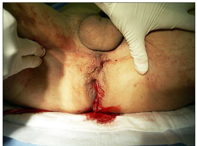
FIG. 1. A 2-cm diameter penetrating wound (impalement injury) with bleeding in the perirectal region around the anus.

A computed tomography (CT) scan revealed hematoma around the perirectal space, suggesting rectal injury. Furthermore, a CT scan demonstrated a high-density area and free air in the bladder and that the posterior dome of