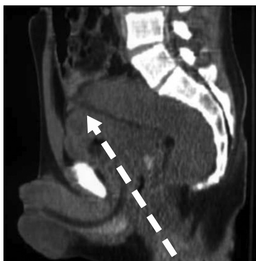
FIG. 3. Injury tracks confirmed by operative findings.

the bladder wall was irregular, thus raising suspicion of a hematoma and a through-and-through bladder perforation from the rectal space (Fig. 2). Although the CT scan demonstrated neither obvious free air nor bowel injury, the existence of abdominal defense made us suspect intraperitoneal bladder rupture.