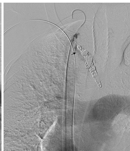
Fig. 1. A 71-year-old female with epigastric pain. A. Fistulography through the catheter shows contrast extravasation into the mediastinum (arrow). B. Non-enhanced CT scan shows the hemodialysis catheter (arrow) outside the superior vena cava and extravasated contrast material in the mediastinum (arrow head) on approximately 10 cm above the right atrium. Right hemithorax and mediastinal hematoma are also noted. C. Superior vena cavogram shows no demonstrable contrast extravasation. D. After retraction of hemodialysis catheter into the SVC, Cavogram demonstrates that hemodialysis catheter perforates the superior vena cava and extravasation of contrast material along the catheter tract into the mediastinum. E. The perforating tract of superior vena cava was embolized with microcoils. After microcoils embolization, extravasation of contrast material (arrow) was still seen.