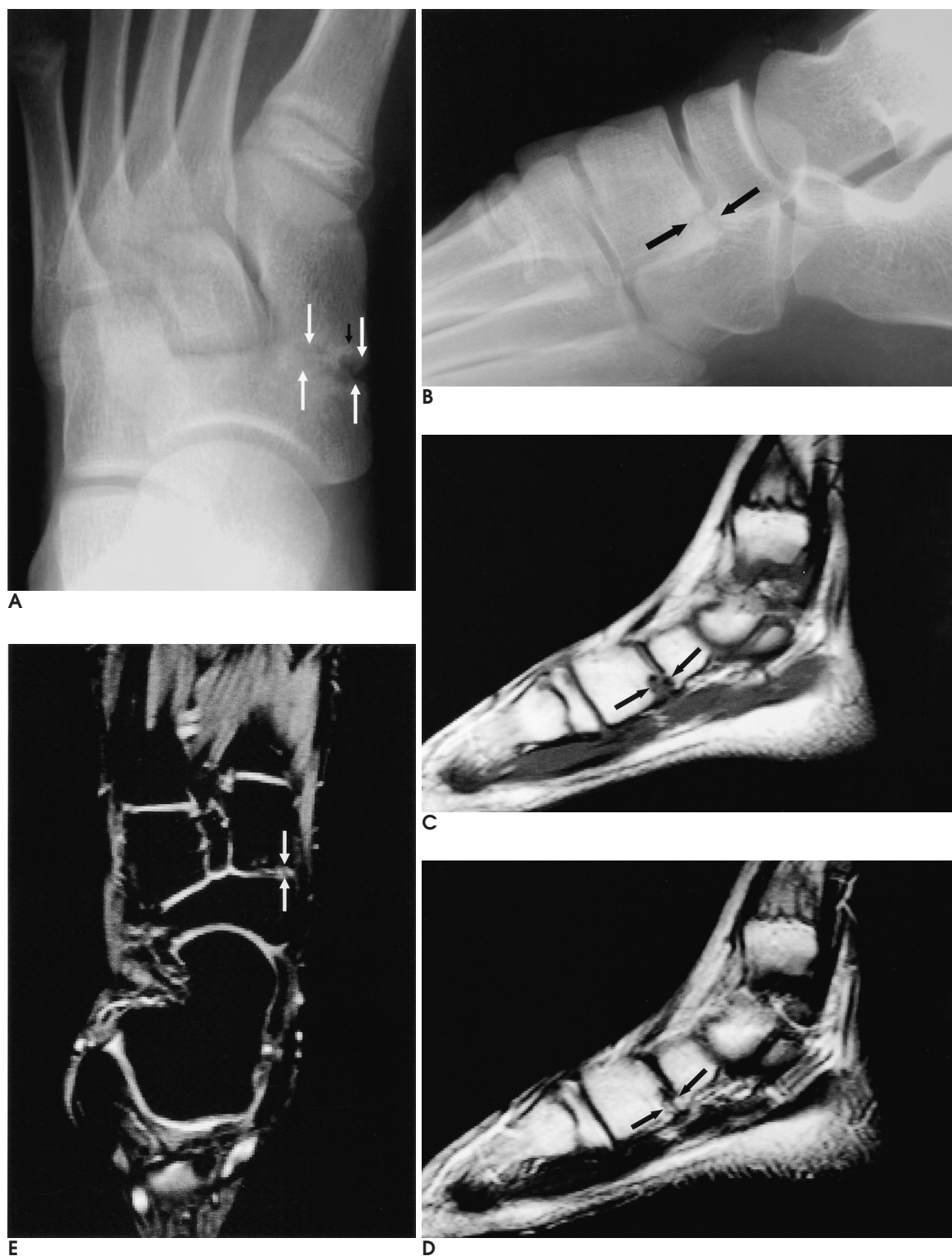
Fig. 3. 11-year-old boy with a surgically confirmed naviculo-medial cuneiform coalition in his right foot. A, B. Anteroposterior ( A ) and lateral ( B ) radiographs show a cortical irregularity (large arrows) and a subchondral cyst (small arrow) with reactive sclerosis on the medioplantar side of the naviculo-medial cuneiform joint. C. Sagittal T1-weighted spin echo image (TR/TE, 500/12) shows a low signal-intensity fusion on the plantar side of the naviculo-medial cuneiform joint (arrows). D, E. Sagittal T2-weighted ( D ) fast spin-echo (TR/TE, 3000/96) and axial T2* ( E ) (TR/TE, 608/18, flip angle 20 degree) images show high signal intensity of this lesion with an irregular articular surface (arrows). This was confirmed at surgery as being a cartilaginous coalition.