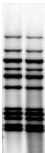
Figure 2. Insertion sequence 6110 (IS6110) Restriction Fragment Length Polymorphism (RFLP) typing shows that the two isolates are identical. Lane 1, M. tuberculosis from the close contact, Lane 2, M. tuberculosis from the source patient.