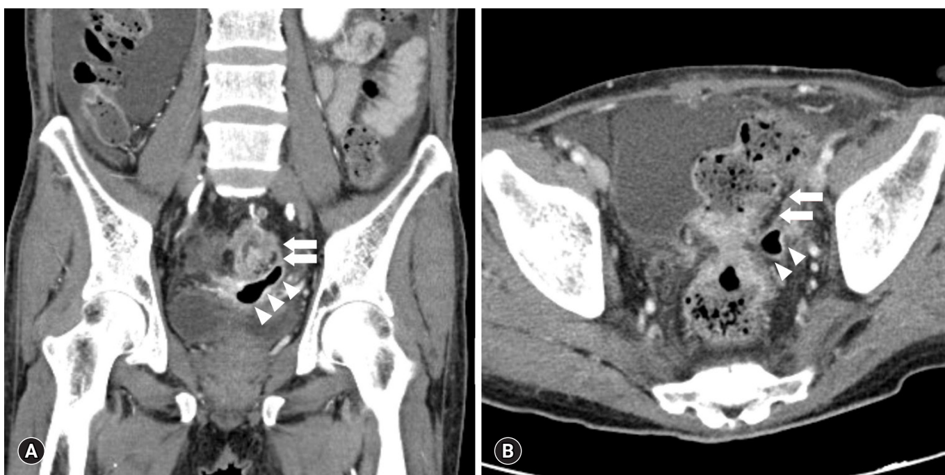
Fig. 3. The abdominal computed tomography (A, coronal view; B, planar view) shows segmental wall thickening (arrows) of the rectosigmoid junction with adjacent free air (arrowheads).

There are several mechanisms by which purulent pericarditis can develop: a direct spread of a thoracic infectious focus [4], hematogenous spread [5], and very rarely as an extension from a