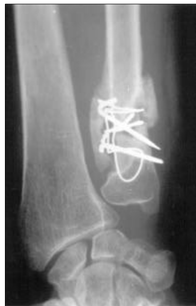
Fig 5. Hypertrophic delayed union noted at a postoperative 4 months X-ray of a type III isolated distal ulnar shaft fracture.

A fracture of the ulnar shaft is referred to as a nightstick fracture, and usually results from a low-energy injury. Therefore, a displacement of