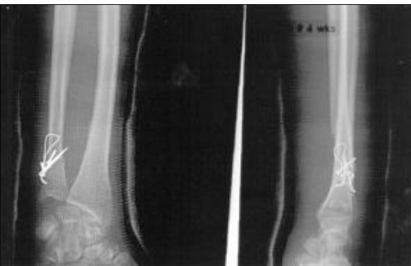
Fig 3. Type I distal ulnar fracture treated with tension band wiring.

was successful. A clinical union was defined as a non-tender, non-mobile fracture site to palpation with set range of motion. Radiological union was defined as a bridging of the fracture line by the callus and a progressive obliteration of the fracture line by bony trabeculae. The clinical results were classified as modified from Altner and Hartman 10 including residual pain, bony union and the range of motion of the forearm and wrist. Complete bony union without residual pain and 90% or more of the normal forearm rotation and wrist motion was considered to be excellent. Complete bony union with mild pain and 70-90% of normal forearm rotation and wrist motion was considered good. Incomplete bony union with severe pain and < 70% of normal forearm rotation and wrist motion was considered to be a poor result.