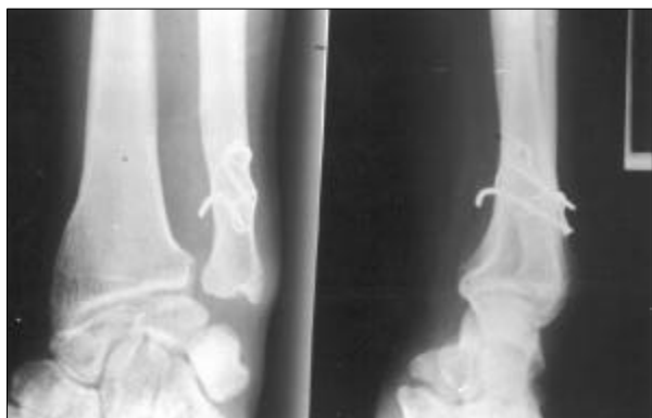
Fig 4. Union state of a Type II isolated distal ulnar shaft fracture 12 months after surgery.

minution and the time to union. Two cases underwent delayed surgery because of concomitant vital injuries such as a hemopneumothorax and a subdural hematoma. However, the delayed procedures had no effect on the union.