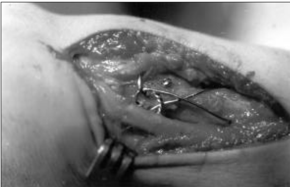
Fig 2. Intraoperative finding of minimal periosteal stripping in a distal ulna fracture.

than satisfactory. The method of fixation was selected according to the displacement and comminution of the fracture. The tension band wire technique applied to avoid damage to the interosseous membrane, extensive periosteal stripping and DRUJ injury (Fig. 2). The open reduction and internal fixation were performed with the tension band wiring technique with an additional miniscrew or Herbert's screw fixation in 10 cases (Fig. 3). Two cases with a severe comminuted displacement of a type III fracture were treated by additional transverse percutaneous 0.045-inch Kirschner wire pinning in the DRUJ. Three cases were fixed with double tension band wiring. The transverse percutaneous K-wire of the DRUJ was removed 4 weeks after surgery. Cast immobilization of the wrist was done for 6 weeks after surgery before active movement of the wrist was allowed. The clinical and radiological evidence was used to determine whether or not the union