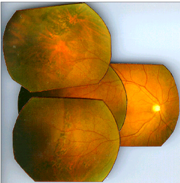
Fig. 2. Fundus panoramic photograph taken 3 months after laser treatment. The retina is well attached with visible laser scars (dark gray dots) along the margin of the previously redetached area (6.30 to 9 o'clock).

0.7, and the retinal detachment was accompanied by lattice degeneration and atrophic holes between 11 and 2 o'clock. Retinal attachment was performed by segmental buckling using a 3.0 mm