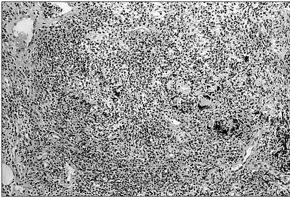
Fig. 1. Diffuse granulomatous inflammation of nasal mucosa. Note irregularly arranged multinucleated giant cells among lymphocytes, histiocytes, and neutrophils (H&E, \times 100 ).