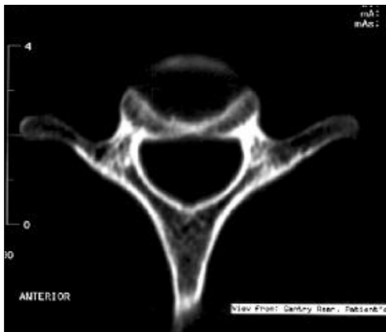
Fig. 2. The CT scans shows the characteristics of C7. Lateral mass is relatively thin and acute posterior angle.

† Significant difference of mean depth of screw on C7 level ( p -value: 0.02) between two methods. No other significant difference in another levels between two methods.