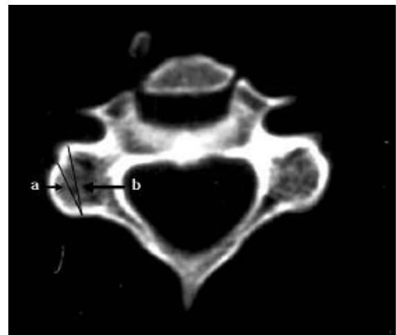
Fig. 3. (a) The theological trajectory of screw with lateral angle of 25 degrees based on Magerl's method. (b) The theological trajectory of screw with maximal depth (The lateral angle is smaller than 25 degrees).

(Table 2). The lateral angle of screw in Magerl's method was originally 25°, however, as an application of Magerl's method, an ideal lateral angle that maximized the depth and avoid injuring vertebral artery in CT scan was 19.6 \pm 3.5^\circ and the maximal depth of screw like that was 13.5 \pm