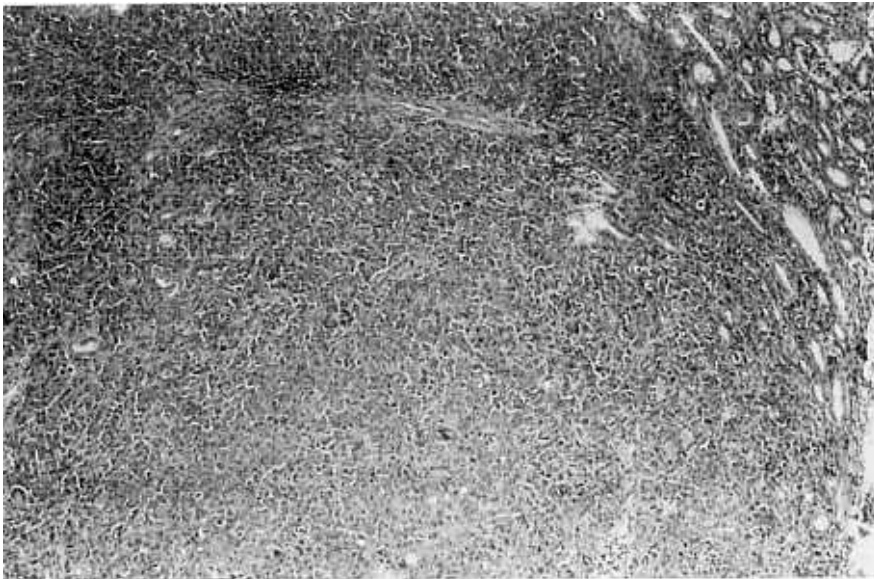
Fig. 3. Renal tumor in renal cortex: Central necrosis is seen in the middle of tumor. The tumor demonstrates necrotic area with mixed granular, acellular debris. There are dense infiltrations of lymphocytes and macrophages in the tumor mass. Pressure deformation in the normal renal parenchyme can be observed.