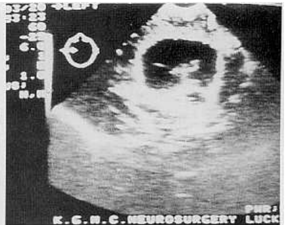
Fig. 2. Intraoperative ultrasonogram (A) anterior portion, (B) posterior portion showing well defined mass with multiple hypoechoic areas.