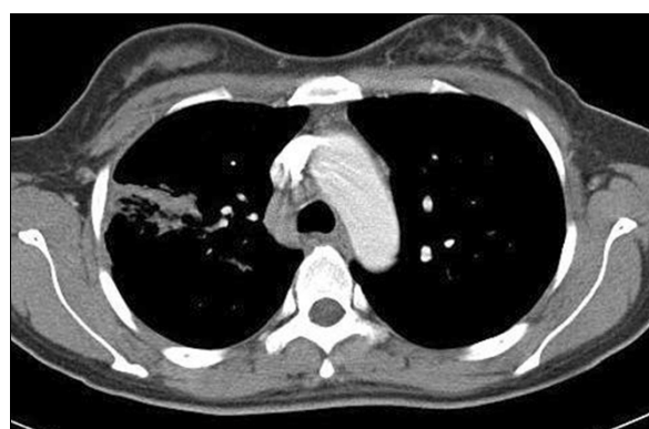
Figure 3. Chest CT scan showed right paratracheal lymph nodes enlargements and parenchymal infiltrates on right upper lobe. CT: computed tomography.

normal blood cells were on peripheral blood smear. Hemoglobin was 11.7 g/dL, Hct 36.6% , MCV 82 fL (normal range, 81~101), MCH 26.2 pg (normal range, 26.2~34.2) and platelets were 213,000/mm 3 . In urinalysis, no protein and red blood cells were detected. In blood chemistry, BUN was 11.5 mg/dL, creatinine 0.57 mg/dL, uric acid 3.0 mg/dL, total bilirubin 0.6 mg/dL, AST 14 IU/L, ALT 16 IU/L, alkaline phosphatase 297 IU/L, total protein 6.5 g/dL, albumin 4.3 g/dL and globulin 2.2 g/dL. Serum iron was 6 \mu g/dL (normal range, 50~170), total iron binding 305 \mu g/dL (normal