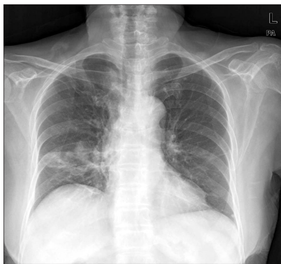
Figure 1. A chest radiograph revealed an ill-defined consolidation in the right lower lung fields and fibrotic change in the right upper lung fields.

buminemia (3.0 g/dL), and elevated C-reactive protein levels (12.26 mg/dL). Three acid-fast bacilli tests of sputum were negative. A chest radiograph showed an ill-defined consolidation in the right lower lung fields and fibrotic change in the right upper lung fields (Figure 1). Computed tomography (CT) scans of the chest showed multiple, ill-defined nodules in the right middle lung and multiple variable-sized mediastinal lymph nodes (Figure 2A). In addition, CT scans of the chest showed an irregular cavity that communicated from the right