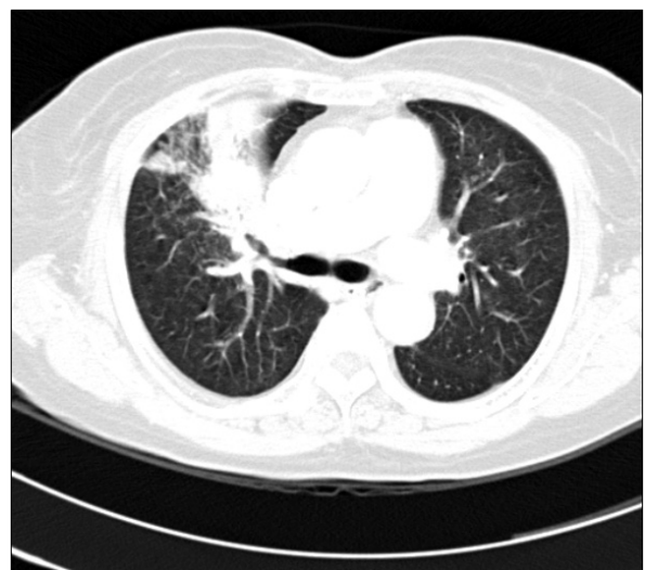
Figure 2. Chest computed tomography scan showed air-space consolidation and multiple centrilobular nodules in right upper and middle lobe with irregular luminal narrowing of anterior segmental bronchi of right upper lobe.