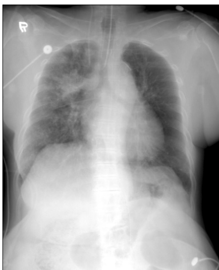
Figure 1. The chest radiography showed consolidation combined with linear opacity on right upper lobe.