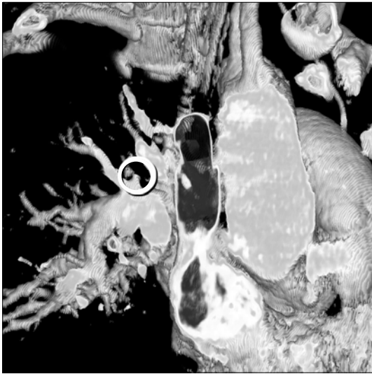
Figure 3. Reconstructed pulmonary embolism CT demonstrated a small sacular aneurysm in proximal portion of the segmental branch, right upper lobar pulmonary artery and diffuse bronchial wall thickening in right main and upper lobar bronchus.