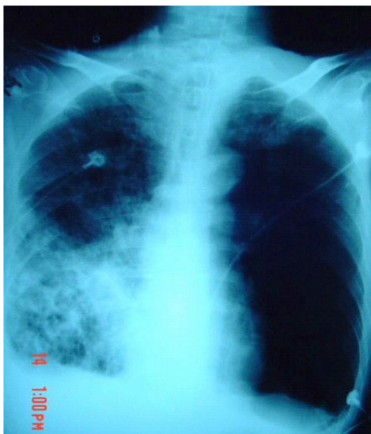
Fig. 3. The consolidation observed on the chest radiograph on the 10th day decreased, although pneumonic infiltrations and areas of cavitation were still present

septicemia. However, on Day 12, the patient suddenly lost consciousness and a hemodynamic collapse, which culminated in pulseless bradycardia, ventricular fibrillation and death.