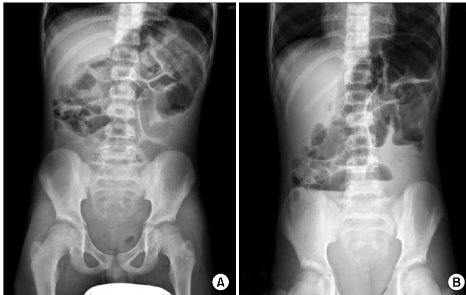
Fig. 1. A plain x-ray of the abdomen (A: supine view, B: erect view) showing a mechanical small bowel obstruction with 'step-ladder' air-fluid pattern in the erect film.

tifocal air-fluid at the mid-abdominal level, and distended small bowel loops (Fig. 1). An abdominal pelvic computed tomography (CT) scan taken on the second hospital day revealed mechanical small bowel obstruction at the distal ileum, with a transition zone (Fig. 2). In this obstructed area, we delineated hypodense mass structure; however, we couldn't identify what it was. The abdominal pain was not relieved, and bilious vomiting continued, upon application of nasogastric tube drainage. An abdominal x-ray performed on the third hospital day showed that the mechanical ileus had become increasingly aggravated.