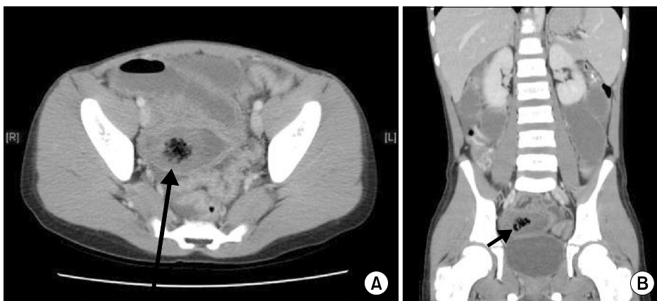
Fig. 2. Abdominopelvic computed tomography scan (A: axial view, B: coronal view) showing the 1.8 cm-sized round intraluminal hypodense mass (black arrows) with a 'mottled gas' pattern in the lumen of distal ileum.