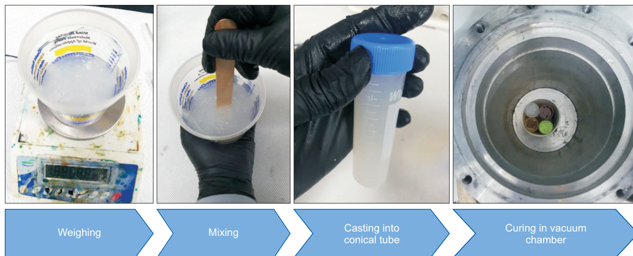
Fig. 1. Fabrication method of markers using DragonSkin™ MEDIUM, BodyDouble™ SILK, PMC™ 780 DRY, and VytaFlex™ 20 (Smooth-On Inc.).