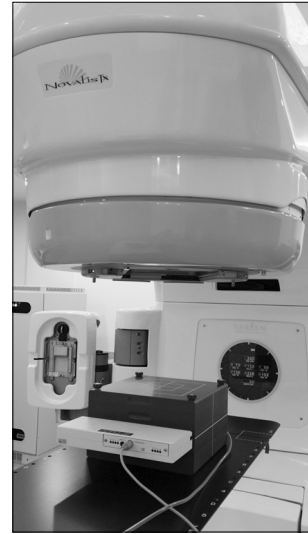
Fig. 4. MapCHECK combined with MapPHAN phantom for the dose measurement in RapidArc treatment.

The additional ten RapidArc plans were prepared with the same MapCHECK phantom, target, OARs and dose prescription as used in the TomoTherapy plans. The DQA plans were prepared for dose measurement by using the ArcCHECK. After the DQA accuracy was confirmed, the measured dose data by using the ArcCHECK was imported to 3DVH for 3D dose calculation in the MapCHECK phantom. The calculated 2D coronal dose distribution at the level of MapCHECK diode detector array was exported, as in the case of the TomoTherapy analysis. The dose difference between the dose meas-