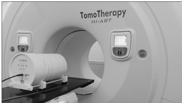
Fig. 3. Dose measurement with ArcCHECK for the TomoTherapy delivery quality assurance (DQA).