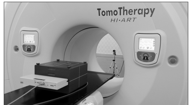
Fig. 1. MapCHECK combined with MapPHAN phantom for the dose measurement in TomoTherapy treatment.

The DQA plans of the prepared TomoTherapy plans were made for the acquisition of measured dose data by using the ArcCHECK device. After the DQA measurement by using the ArcCHECK, as shown in Fig. 3, the error compared with the calculated dose in the TomoTherapy planning system was evaluated using the gamma evaluation method with a 3% dose difference and 3-mm distance-to-agreement criteria. The measured dose data by using the ArcCHECK was imported to 3DVH, and the 3D dose distribution in the MapCHECK phantom was recalculated. The calculated 2D coronal dose distribution at the level of diode detector array was exported in order to compare it with the dose distribution measured in the MapCHECK detector array during the TomoTherapy treatment beam delivery.