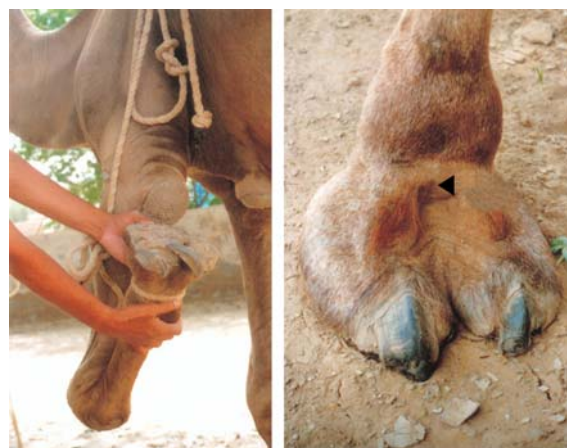
Fig. 1. Left forelimb (Palmer view). Fig. 2. Left forelimb (Dorsal view).

Onyx enlargement is a common feature in canine and felines that warrants trimming at regular interval. Enormous hoof enlargement in bovine, caprine, equine and porcine species has been reported due to laminitis [1,3,4]. Present findings resembles the grain founders in bovine and equine