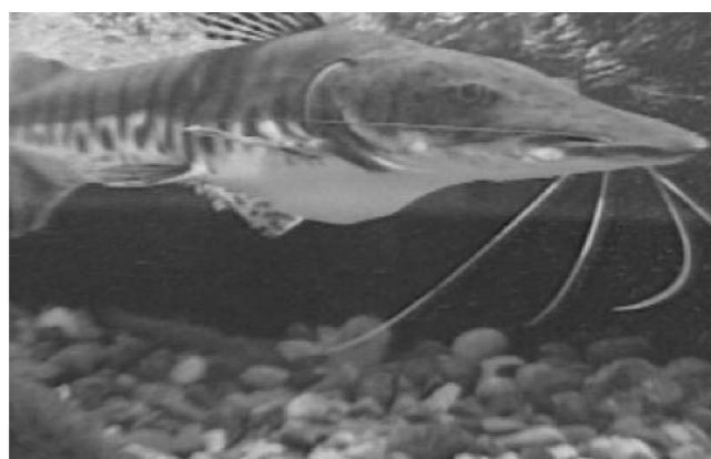
Fig. 1. An enlarged abdomen silhouette.

Dorsoventral radiographic view of abdomen revealed three foreign bodies in stomach that were suspected as stones (Fig. 2a). One of those was round, and the others were narrow and angled. Round thing looked to be in inner part in section of swim bladder margin, and the others looked to be in outer part in section of swim bladder margin. However, only one of narrow and angled foreign bodies looked to be in outer part in section of swim bladder margin in left lateral view (Fig. 2b). Cranial two foreign bodies pressed liver cranioventrally in both dorsoventral and left lateral view, and caudal foreign body pressed spleen dorsally in both dorsoventral and left lateral view (Fig. 2).