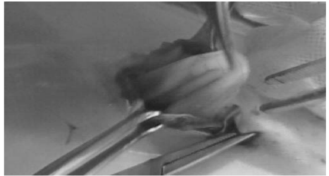
Fig. 3. After celiotomy, stomach is manipulated by Addison tissue forceps.

Separating tissues created exposure of abdomen, and provided visualization of the liver, stomach and bowel. With manipulation the stomach and spleen were located and exteriorized. Three separated hard masses were touched by fingers. When the stomach was manipulated to find incision site, it was felt that three masses were getting out of stomach