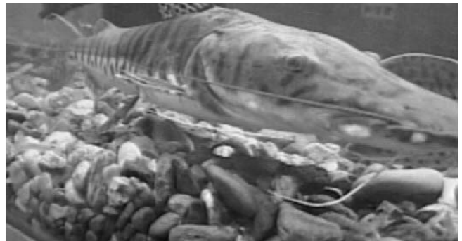
Fig. 4. Enlarged abdomen silhouette is disappeared after operation.

(Fig. 3). Three stones were found in mouth and removed. Muscles were sutured with 5-0 safil® (polyglycolic acid) by a simple interrupted pattern, and skin was sutured with 5-0 dafilon® (polyamide thread) by a simple horizontal mattress pattern [4]. It took about 30 minutes from anesthesia to skin closure. Incision line was sealed against water ingress with cyanomethacrylate (super glue®), which prevents belly from infection. After sealing, incision line was covered with mucus taken from allogenic skin to reinforce the function of water proof and to prevent infection.