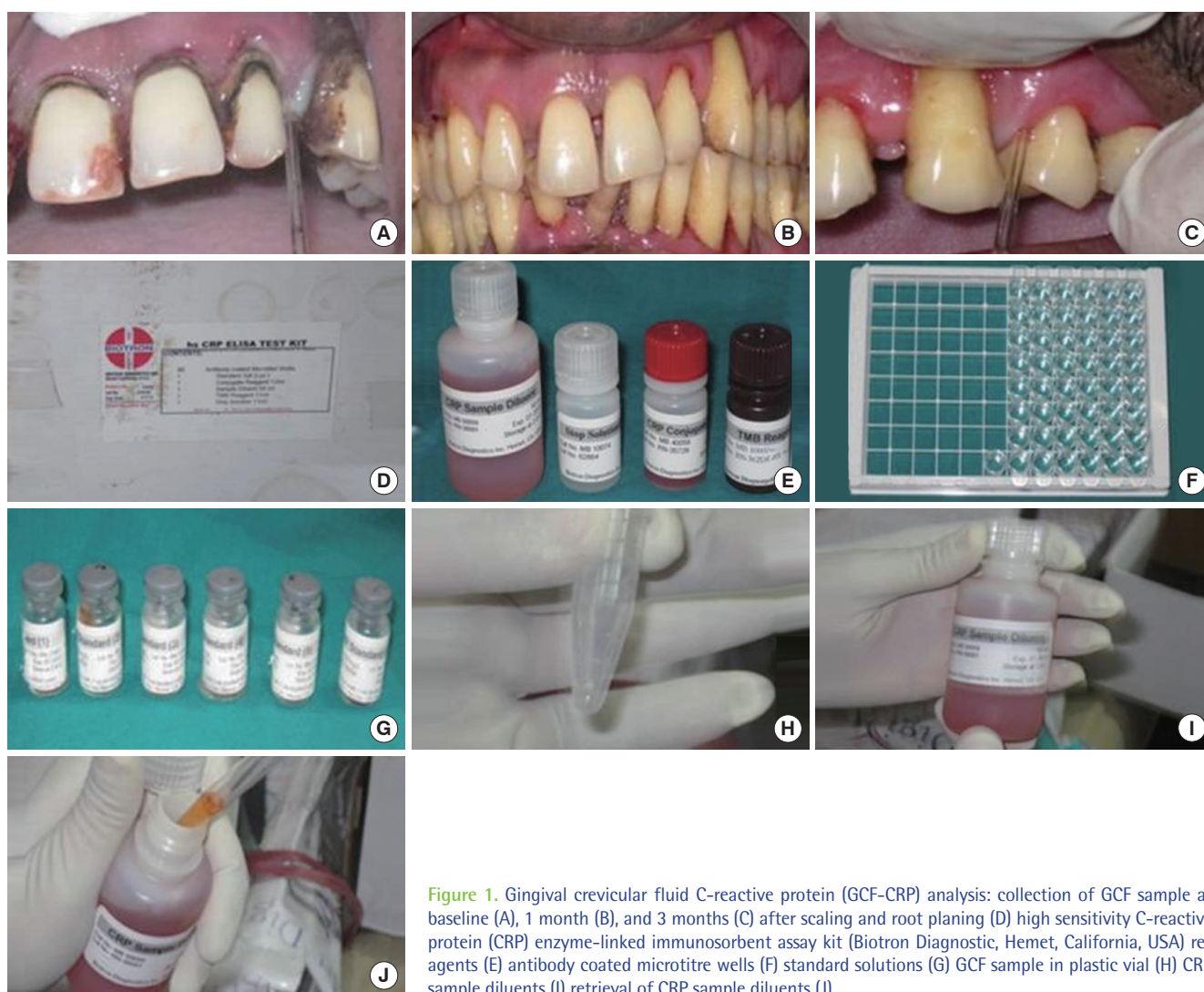
Figure 1. Gingival crevicular fluid C-reactive protein (GCF-CRP) analysis: collection of GCF sample at baseline (A), 1 month (B), and 3 months (C) after scaling and root planing (D) high sensitivity C-reactive protein (CRP) enzyme-linked immunosorbent assay kit (Biotron Diagnostic, Hemet, California, USA) reagents (E) antibody coated microtitre wells (F) standard solutions (G) GCF sample in plastic vial (H) CRP sample diluents (I) retrieval of CRP sample diluents (J).

The collected GCF sample was then assayed for CRP levels by using a highly sensitive CRP enzyme-linked immunosorbent assay (ELISA) kit (Biotron Diagnostic, Hemet, CA, USA), as per the manu-