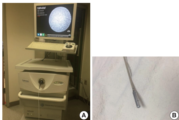
Fig. 4. Cellvizio system for probe based confocal laser endomicroscopy (A) and a probe (B).

Crypt architecture, microvascular alterations, fluorescein leakage, and cellular infiltrates within the lamina propria are important observational markers in CLE evaluation. 12,41–44 CLE can aid in demonstrating mucosal healing in terms of deep remission beyond the absence of mucosal ulceration.