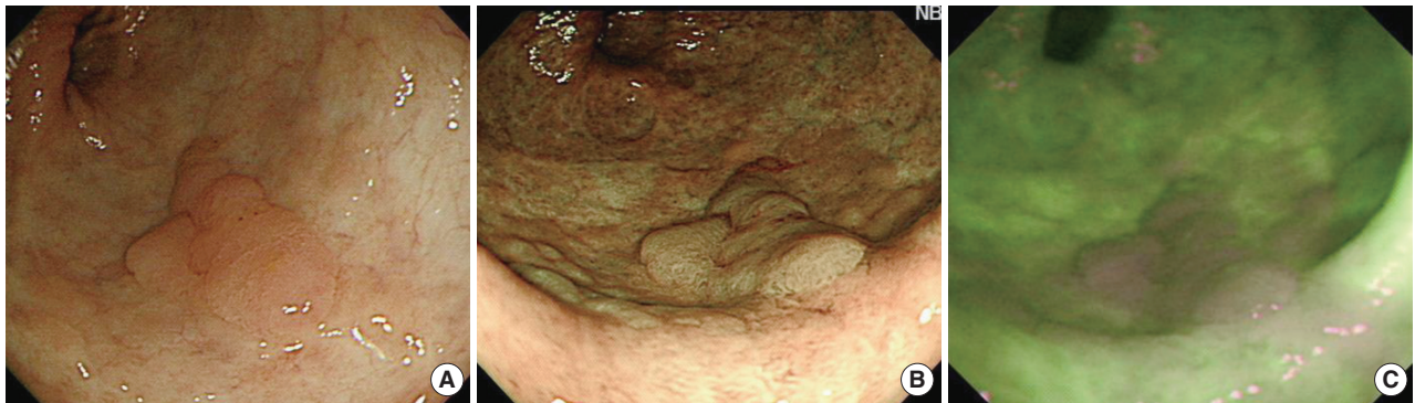
Fig. 2. Observation findings of colonic dysplasia using white light endoscopy (A), narrow band imaging technique (B), and autofluorescence imaging technique (C) in ulcerative colitis.