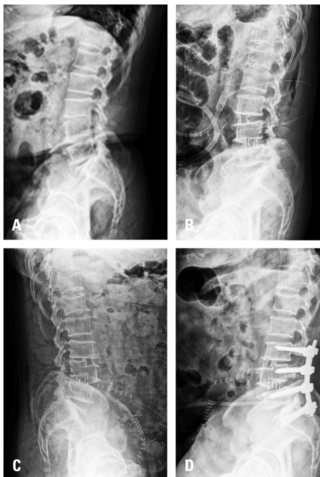
Fig. 2. (A) Preoperative and (B) immediate postoperative lateral radiographs of a 68-year-old male patient. (C) At 2 weeks postoperatively, a radiograph showed a L4 vertebral body coronal fracture. (D) Additional posterior instrumentation was performed.

OLIF as a viable alternative to existing LIF techniques, by showing radiologic and clinical improvements in patients with degenerative lumbar diseases, including degenerative spondylolisthesis, kyphoscoliosis, and discogenic pain. 4)