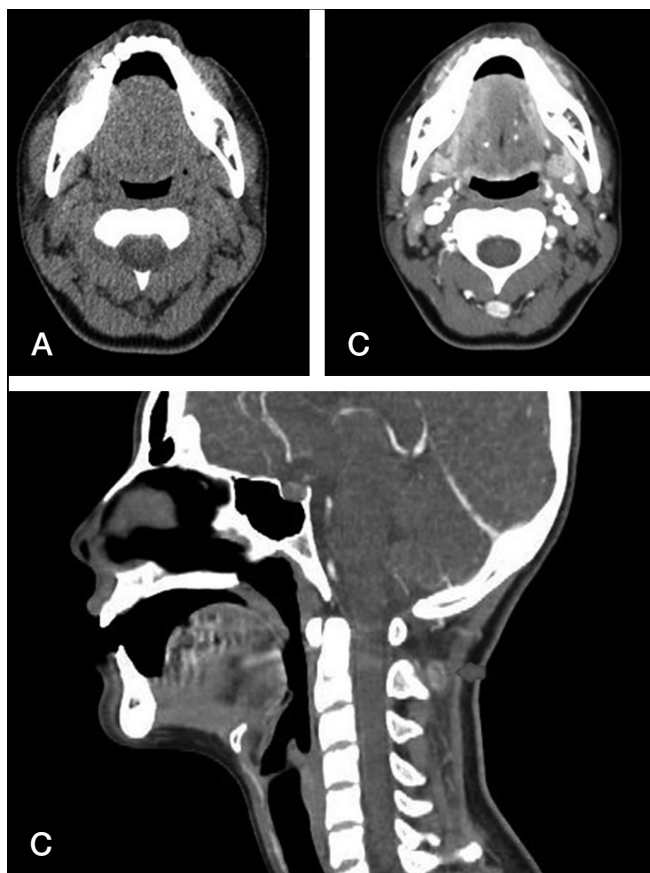
Fig 1. (A) A CT scan of the soft tissue tomography reveals a 1.2 cm sized oval shaped well-defined mass. (B) A CT scan of the soft tissue tomography with enhancement reveals a strongly enhancing soft tissue mass between the superficial and deep muscle layers of the posterior neck. (C) A CT scan of the soft tissue tomography with sagittal reconstruction shows that the mass is located posterior to the spinous process of C2.

enhancing, well-defined, ovoid soft tissue mass posterior to the spinous process of C2 (Fig. 1 A-C). She had no evidence of