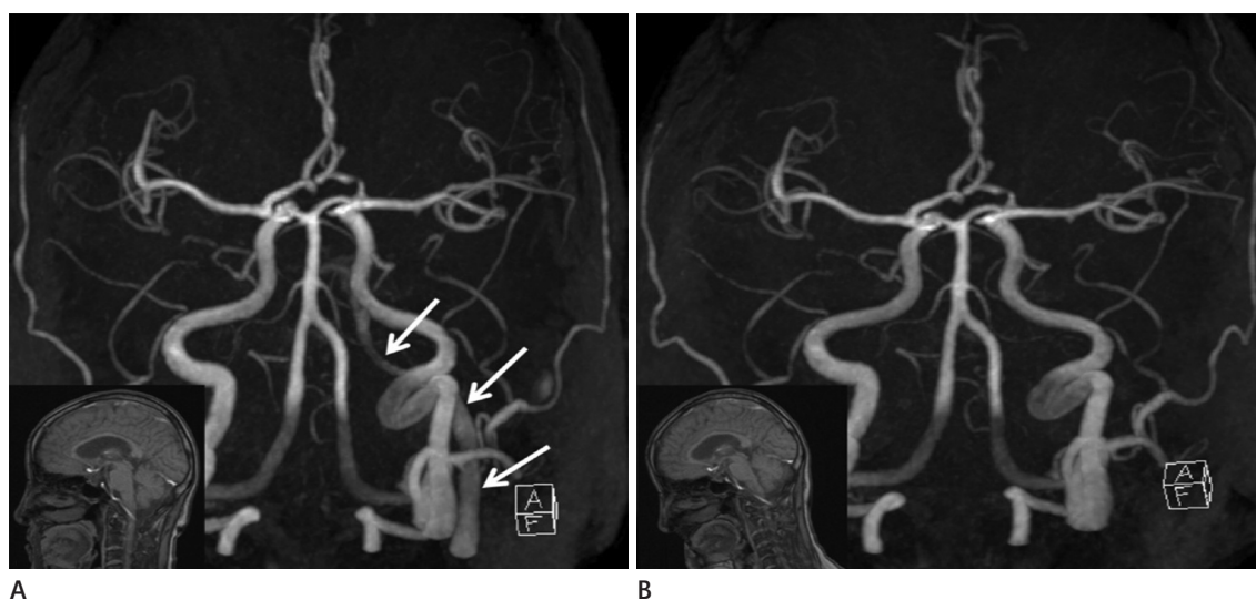
Fig. 2. Loss of flow-related signal on TOF MRA.

Bilat. = bilateral, CS = cavernous sinus, IJV = internal jugular vein, IPS = inferior petrosal sinus, SS = sigmoid sinus