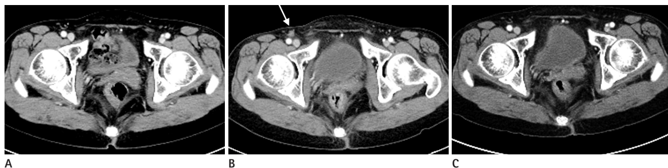
Fig. 2. A 59-year-old female patient (patient #4) underwent TACE for HCC, and after the procedure ExoSeal was applied in the right CFA. The second TACE was performed after 3 months of follow-up. At that time, the puncture site was closed using simple manual compression.

The 16 patients included in this study underwent a total of 34 CFA punctures and 21 closures with an ExoSeal VCD. The mean number of punctures per patient was 2.13 (range, 1–5) and mean