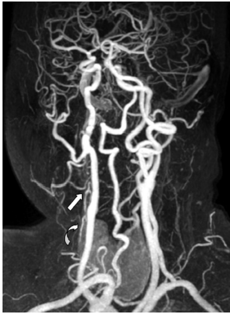
Fig. 1. Anteroposterior maximum intensity projection image of contrast-enhanced MR angiography shows the right CCA is not bifurcating. The right superior thyroid artery (curved arrow) and lingual-facial trunk (arrow) are originating from CCA level of the nonbifurcating cervical carotid artery. Other ECA branches are arising from the probable proximal ICA level of the nonbifurcating cervical carotid artery. CCA = common carotid artery, ECA = external carotid artery, ICA = internal carotid artery