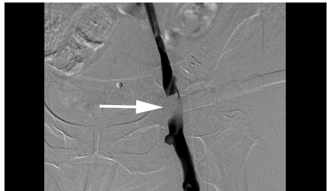
Fig. 3. Ascending venography (prone position) shows extrinsic compression of the right common femoral vein (white arrow). There is no evidence of deep vein thrombosis.

Benign cystic lesion, associated with compression of the femoral vein and lower leg edema around the hip joint is a rare condition. Until now, 33 cases have been reported in literature, including this case (2-4). Histologically, there are two types of cysts: synovial and ganglion cysts. While synovial cyst is a juxta-articular fluid collection lined by synovial cells, ganglion cyst is thought to be a myxomatous degeneration of certain fibrous tissue structures without the lining of synovial cell (3). Since the treatment for these two para-articular cysts is similar, clinical differentiation of ganglion and synovial cysts may not be impor-