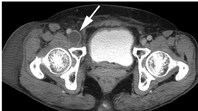
Fig. 2. The CT scan shows a cystic mass compressing the right common femoral vein (white arrow).

confirmed the diagnosis of a synovial cyst (Fig. 4). Surgical removal of the synovial cyst restored normal venous return and promptly relieved the patient's symptoms. The patient was discharged on the fifth postoperative day.