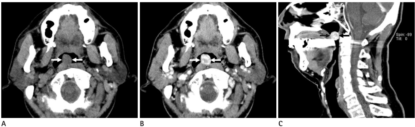
Fig. 2. CT features of nasopharyngeal angioleiomyoma.

cially, pleomorphic adenoma) of the pharyngeal mucosal space as a possible diagnosis. No significant cervical lymphadenopathy was noted. The patient underwent surgical excision of the mass. The mass appeared spherical, pedunculated, and originated from the posterior nasopharyngeal wall. Complete removal of the mass was achieved and the histologic findings were consistent with angioleiomyoma (Fig. 3A, B). An immunohistochemical study demonstrated diffuse, strong positivity for smooth muscle actin (Fig. 3C). No significant bleeding occurred during the operation. The postoperative course was uneventful, and there has been no evidence of tumor recurrence at 12 months after surgery.