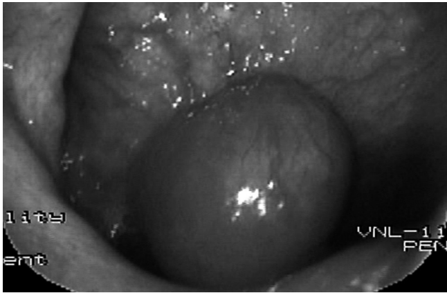
Fig. 1. Laryngoscopic examination shows a smooth, spherical mass originating from the posterior wall of the nasopharynx.

cially, pleomorphic adenoma) of the pharyngeal mucosal space as a possible diagnosis. No significant cervical lymphadenopathy was noted. The patient underwent surgical excision of the mass. The mass appeared spherical, pedunculated, and originated from the posterior nasopharyngeal wall. Complete removal of the mass was achieved and the histologic findings were consistent with angioleiomyoma (Fig. 3A, B). An immunohistochemical study demonstrated diffuse, strong positivity for smooth muscle actin (Fig. 3C). No significant bleeding occurred during the operation. The postoperative course was uneventful, and there has been no evidence of tumor recurrence at 12 months after surgery.