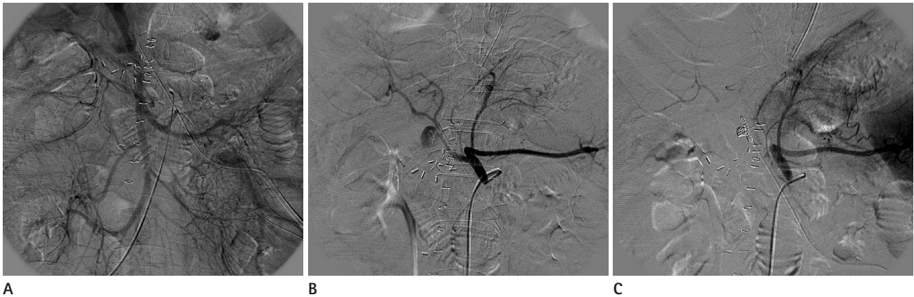
Fig. 2. A 62-year-old man with distal CBD cancer. A. Indirect portogram shows a patent portal vein without stenosis. B. Celiac angiograph reveals a pseudoaneurysm arising from the stump of the gastroduodenal artery. C. Celiac angiograph obtained immediately after hepatic artery occlusion showing intra-hepatic arterial flow through the right inferior phrenic artery. Liver function was aggravated immediately after the procedure, but was normalized 1 week later. Note. —CBD = common bile duct

tect procedure-related complications and to ensure complete thrombosis of pseudoaneurysms.