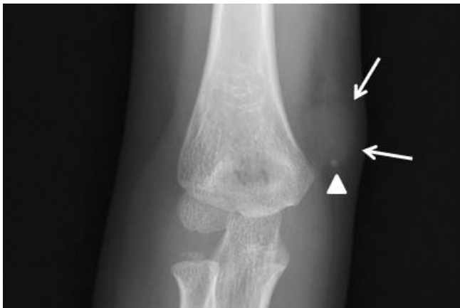
Fig. 1. Anteroposterior plain radiographic finding for case. Anteroposterior plain radiograph of the right elbow shows a phlebolith (arrowhead) within the soft tissue mass (arrows).

surrounding structures. The mass was seen to be a well circumscribed, lobulated, multilocular cystic mass with a maximum diameter of 19 mm, localized in the prefascial subcutaneous tissues, and anteromedial aspect of the right medial epicondyle of humerus (Fig. 2). The mass had an intermediate to slightly high signal intensity on T1-weighted sequences and hyperintense signal intensity with internal thin septae on T2-weighted sequences. Focal dot-like dark signal intensity was noted within the mass for all sequences that corresponded to the phlebolith