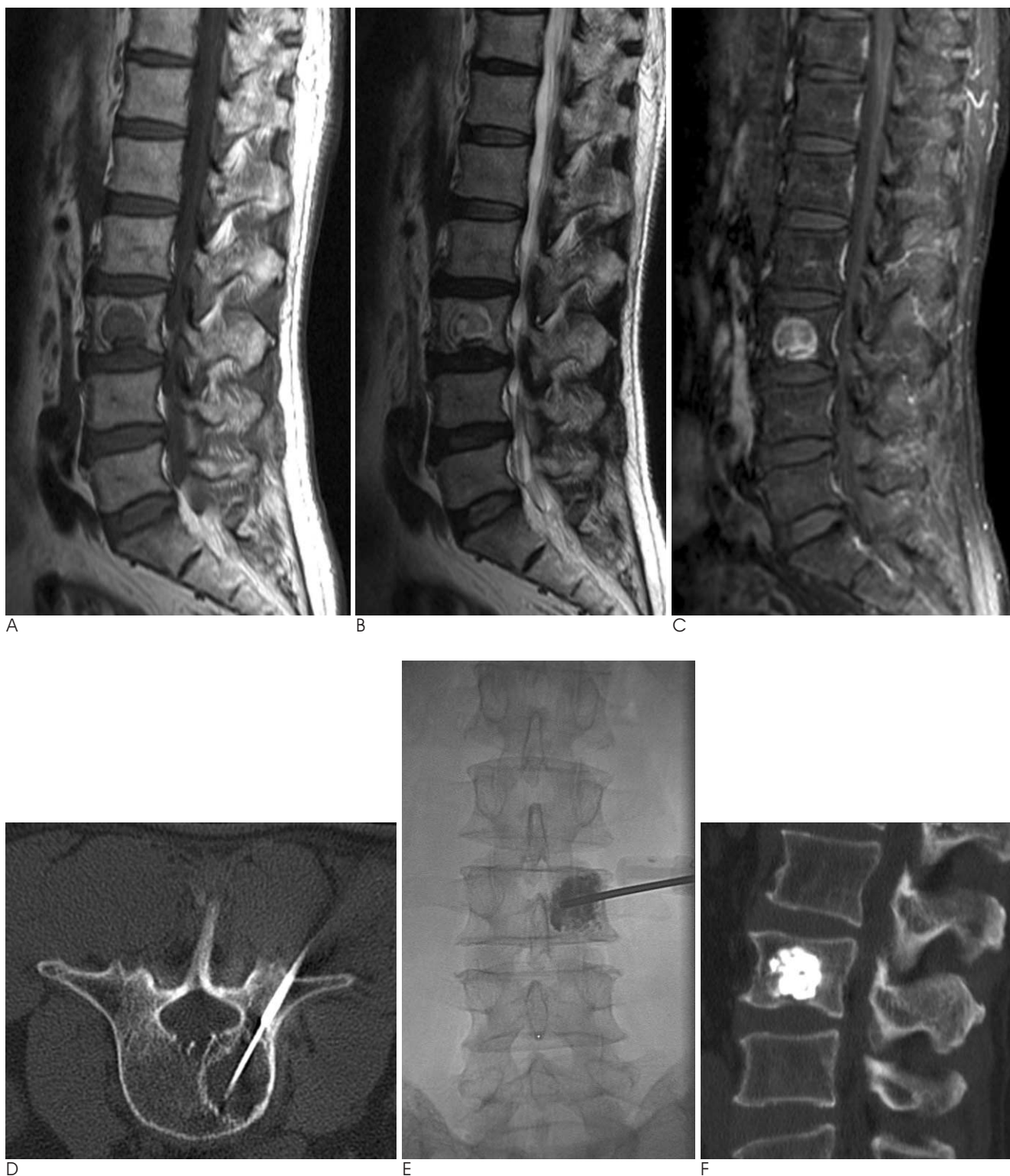
Fig. 1. RFA and combined percutaneous vertebroplasty of spinal metastasis in a 59-year-old man with hepatocellular carcinoma. Sagittal T1 (A), T2 (B), and post-contrast fat suppressed T1 (C) - weighted images of the lumbar spine show a round mass lesion in the L3 body with T1 low, T2 heterogeneous high signal intensity, diffuse and prominent peripheral enhancement, representing a metastatic lesion. Axial CT scan during RFA (D) demonstrates the inserted RFA needle with a 3 cm active tip in the center of the lesion through the 11-gauge vertebroplasty cannula. Bone cement is well packed in the center of the metastatic lesion on the immediate prone AP view (E) and sagittal CT scan (F) after combined vertebroplasty.