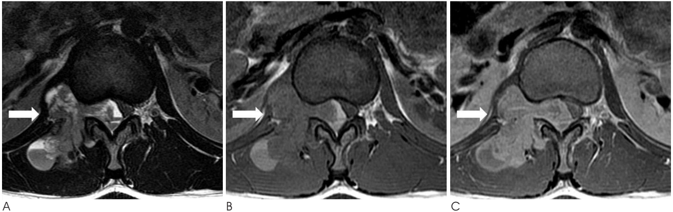
Fig. 1. Primary epidural peripheral primitive neuroectodermal tumor in a 12-year-old boy with low back pain. Axial MR images demonstrate an extradural mass with multi-lobulating contour, extending from the L1 to L2 level with spinal cord compression and extending to the right neural foraminal zone and paraspinal muscle. A. Axial T2WI (TR/TE: 4000/123) demonstrates an isointensity, with multifocal hyperintensity which appear as a cyst-like lesion. B. T1WI (TR/TE: 600/7) shows isointensity of the epidural tumor. C. Gadolinium-enhanced fat suppressed T1WI shows mild enhancement.

Following surgery, the patient received two cycles of chemotherapy (vincristine, doxorubicin, cyclophosphamide, ifosfamide, and etoposide) and one cycle of radiotherapy (4500 rads for 5 weeks). Sixteen months post-operatively, follow-up MR imaging and positron emission tomography revealed no remnants or other tumors. The patient was stable without symptoms at the latest follow-up examination.