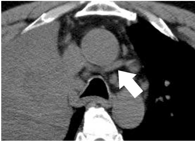
Fig. 2. Non-enhancement CT scan shows that the posterior branch (arrow) mimics an enlarged lymph node.

primitive sinus venosus. At 8 weeks, between the right and left precardinal veins, a new transverse anatomic channel (i.e. the upper transverse capillary plexus), develops and forms the LBCV. The portion above the anastomosis and the LBCV of the right precardinal vein become the right brachiocephalic vein. The distal portion of the right precardinal vein and the right common cardinal vein become the SVC. Subsequently, the subcardinal vein atrophies and is replaced by the supracardinal vein. At term, the right azygos represents the site of the right postcardinal vein, and the azygos vein orifice marks the junction of the precardinal vein and common cardinal venous components of the SVC (4-7). The exact cause of ALBCV is unknown. Normal precardinal anastomosis develops ventrally to the arterial structures. But, ALBCV is thought to result from the precardinal anastomosis being situated posterior to the truncus arteriosus, and the double LBCV is the consequence of both ventral and dorsal precardinal anastomosis (8).