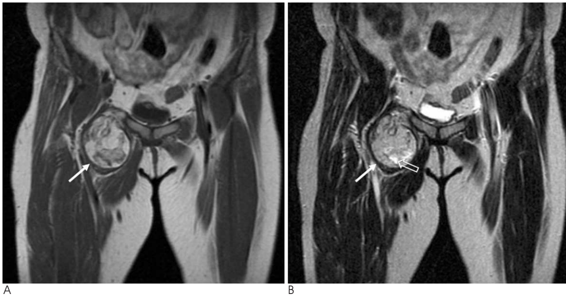
Fig. 1. MR Images of a 35-year-old female with ossifying lipoma in the right inguinal region.

The CT (Somatom plus 4, Siemens, Erlangen, Germany) images were obtained to further determine the nature of the low-signal-intensity structures on the MR images, which showed a well-defined ossified mass that was located between the right pectineus and adductor brevis muscles. Irregular linear bony components were mixed with a hypodense background on the CT images. There was no continuity between the mass and the adjacent pelvic bone. The CT images obtained after intravenous injection of contrast material showed no enhancement in the tumor (Fig. 2A, B).