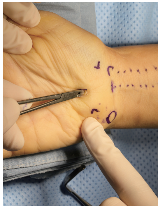
Fig. 4. Confirmation of complete release of transverse carpal ligament with curved mosquito forceps.