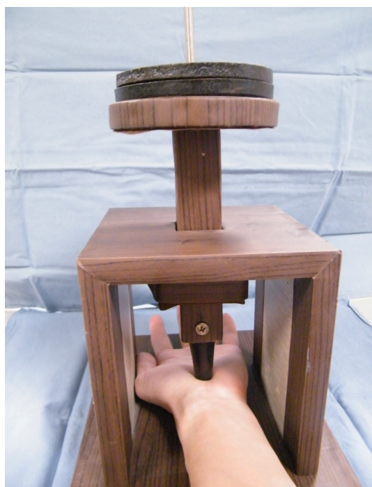
Fig. 1. Measurement of pillar tenderness.

These tests and examinations were repeated 2, 4, and 8 weeks and 3, 6, and 12 months postoperatively. We also evaluated the patients' satisfaction levels with their scars 12 months postoperatively at the outpatient clinic in connection with the reduced size of the incision.