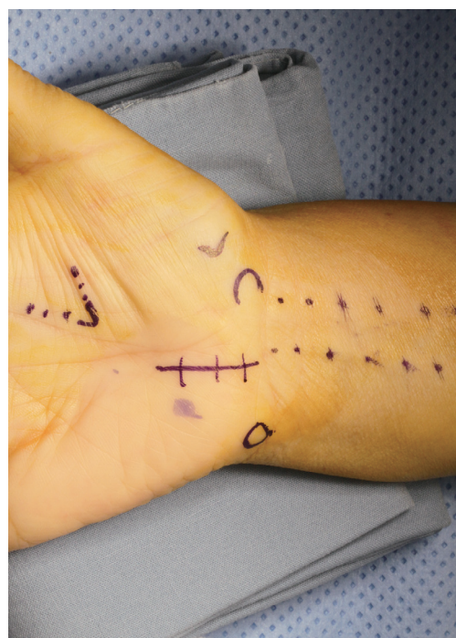
Fig. 2. Skin incision of standard open technique.

The transverse carpal ligament was exposed through a short longitudinal incision along the axis of the ring finger (Fig. 2). Neither the motor branch of the median nerve nor the palmar cutaneous branch was routinely