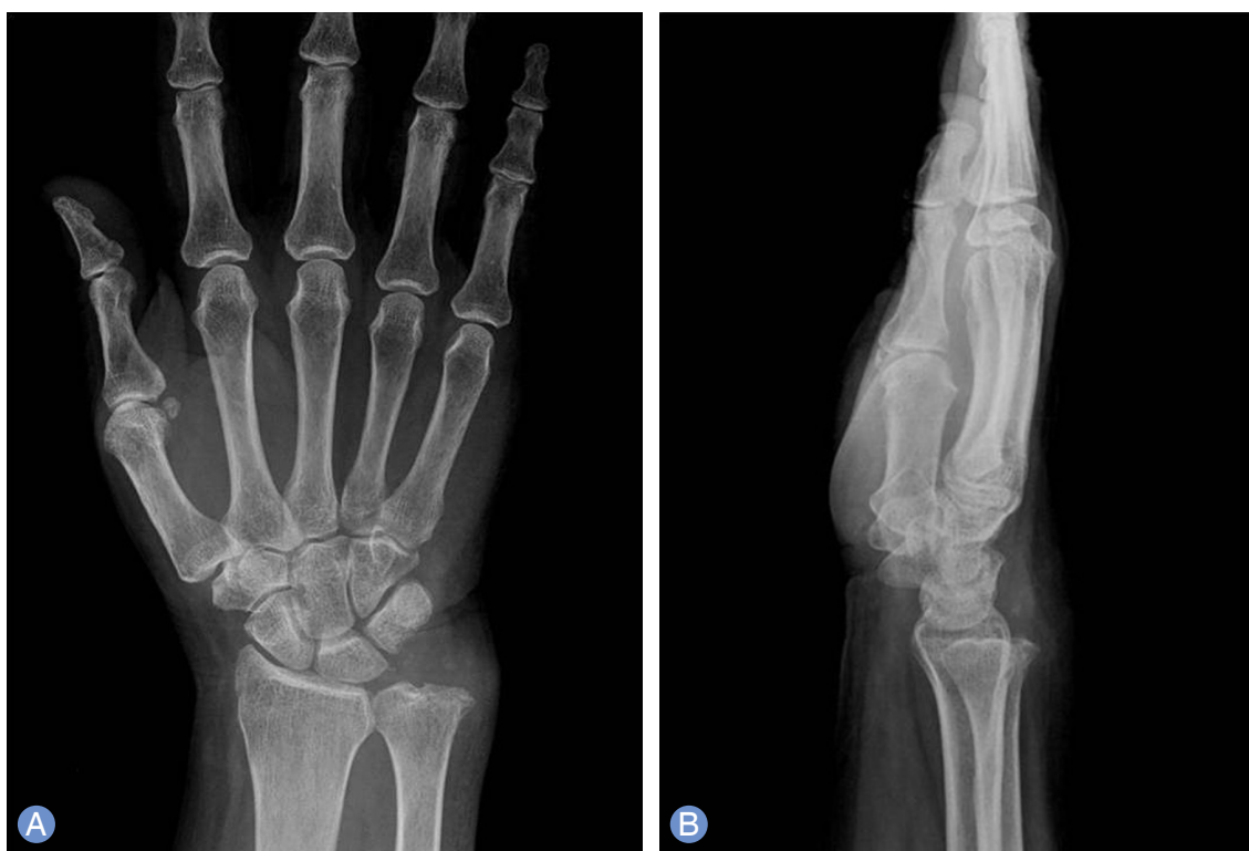
Fig. 4. Anteroposterior (A) and lateral (B) radiographs demonstrating no evidence of recurrent disease at 18 months post-operative follow-up.

ally single and has round marginal articulation with the proximal ulna and located extraarticular to the ulnocarpal joint in nonunion of the ulnar styloid 7 .