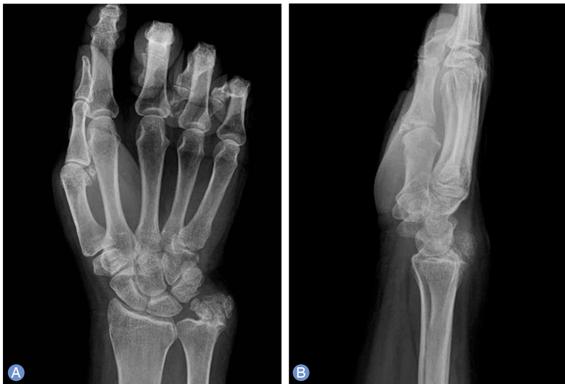
Fig. 1. Multiple osseocartilaginous masses can be observed in the ulnocarpal joint on an anteroposterior radiograph (A) and in the dorsal aspect of the wrist on a lateral radiograph (B).

At operation, the ulnocarpal joint was exposed through a small longitudinal incision between the extensor digiti quinti and the extensor carpi ulnaris. The posterolateral capsule of the ulnocarpal joint was protruded and hypertrophied. After an angular incision of the capsule, a movable, irregular and firm mass was felt inside the capsular tissue. The synovium was hypertrophied. There were a 2×2 cm sized round, lobulated mass and 2 osseous bodies in the ulnocarpal joint. Wide curettage of the synovium including the masses was done. The extensor carpi ulnaris tendon was left in situ. Abnormal osteophytes were found at the tip of the styloid process. The osteophytes of the styloid process were removed. The palmar radioulnar ligament was intact but the dorsal radioulnar ligament was not torn but slack not to cause the distal radioulnar joint instability. Small osseous bodies which had stuck into the triangular fibrous cartilage were debrided not to give the damage to the remained triangular fibrous car-