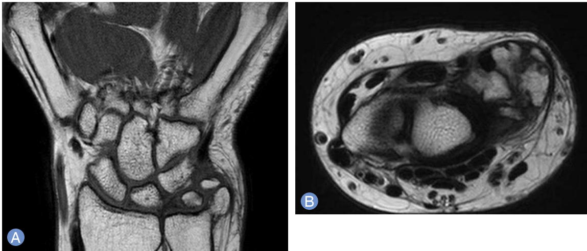
Fig. 2. T1-weighted coronal (A) and axial (B) images showing loose bodies in the ulnocarpal joint.