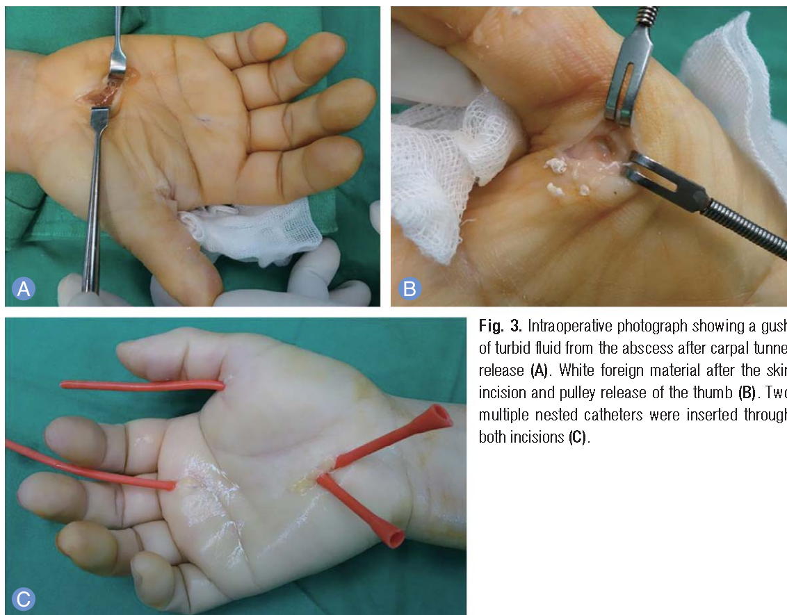
Fig. 3. Intraoperative photograph showing a gush of turbid fluid from the abscess after carpal tunnel release (A). White foreign material after the skin incision and pulley release of the thumb (B). Two multiple nested catheters were inserted through both incisions (C).

Considering the history of triggering of the thumb and middle finger, we planned to release the A1 pulley in addition to closed irrigation using two catheters. The A1 pulleys of the thumb and middle finger were accessed through a limited skin incision over the volar side of each metacarpal head. Another skin incision was made over the volar side of the carpal tunnel to decompress the carpal tunnel and drain the fluid collection. Turbid fluid with solid steroid deposit gushed out of all incision sites (Fig. 3). We incised the transverse carpal ligaments and A1 pulley and performed irrigation. A nested 8F urinary catheter which has multiple side holes throughout the whole length was inserted into the palmar carpal incision and threaded into the bursal tissue and flexor tendon sheath. The catheter was pulled out through the thumb and third metacarpal skin incisions (Fig. 3C). There was outflow of the injected fluid from the distal catheter hole when the irrigation fluid was injected through the proximal hole of the catheter. We also checked the out-