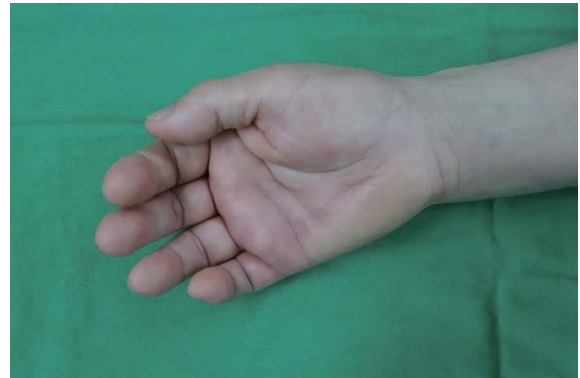
Fig. 1. Preoperative photographs of the right hand. Note the diffuse swelling and erythema of the entire hand including the thenar and hypothenar areas. Swelling was obvious distal to the wrist crease.

Clinical examination revealed edema of the right thenar area and thumb, hypothenar area and little finger, and palm (Fig. 1). There was heating sensation over the entire hand,