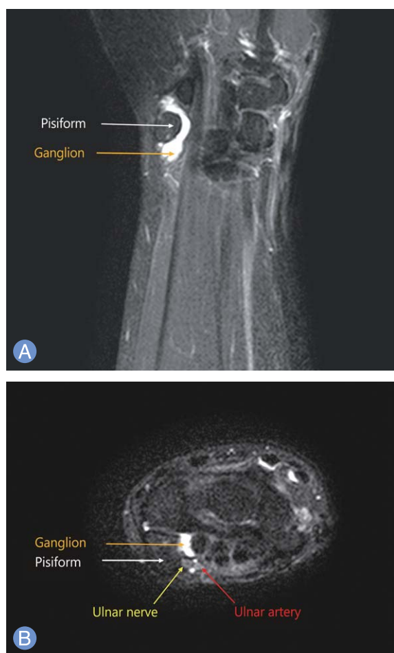
Fig. 2. Magnetic resonance imaging of Guyon's canal. A dumbbell-shaped ganglion at the pisotriquetral joint volarly abutting the ulnar nerve at Guyon's canal was observed. (A) T2 fat suppression coronal image. (B) T2 fat suppression axial image.

canal was seldom reported before 3,4 . In our case, we experienced the double compression syndrome of the ulnar nerve, which was diagnosed late after the surgical decompression of the cubital tunnel. Pearce et al. 7 emphasized the importance of electrodiagnosis and stated that the electrodiagnostic study was sensitive in the detection of compression of the ulnar nerve at Guyon's canal. However, Osterman 8 reported that similar motor latencies were demonstrated between an isolated carpal tunnel syndrome and double compression syndrome and it seemed difficult to classify a single nerve lesion as the double crush syndrome by an electrodiagnostic study. We also experienced the double compression syndrome of the ulnar nerve that could not be correctly diagnosed at initial work up although the NCV study was per-