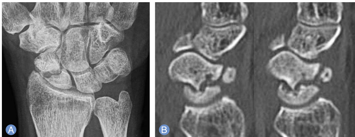
Fig. 1. (A) Preoperative radiographs shows nonunion of scaphoid waist. (B) Computed tomography shows scaphoid nonunion and humpback deformity.

Functional outcome was assessed by an orthopaedic specialist physiotherapist as the palmar-located scars could easily be seen, and included preoperative and postoperative measure-