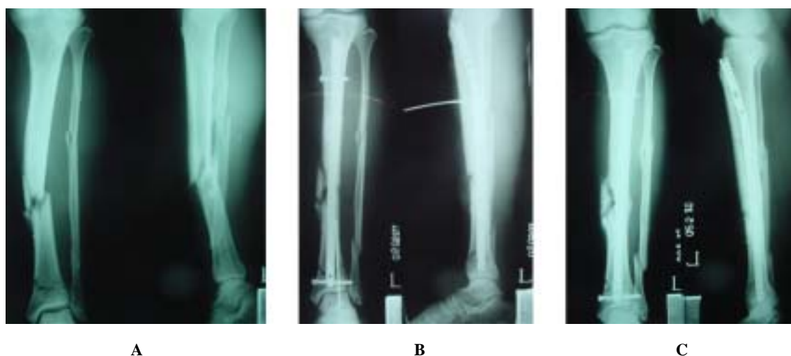
Fig. 4A. A 55-year-old man was injured by traffic accident, and he ha distal tibial and fibular fractures. 4B. He was managed by IC nail with only one distal interlocking screw. 4C. At 3 months later, callus formation was found.

가 (Fig. 3C). 2 cm (Fig. 3A), 3. 3 IC nail (Osteo, Swi- 55 tzerland) (Fig. 3B). 16 가