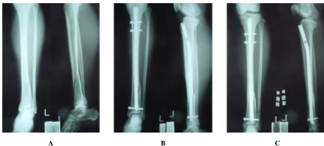
Fig. 3A. 36-year-old woman was injured by slip down, and she had distal tibial and proximal fibular fractures. 3B. She was managed by IC nail. 3C. At 16 months later, bone union was found.