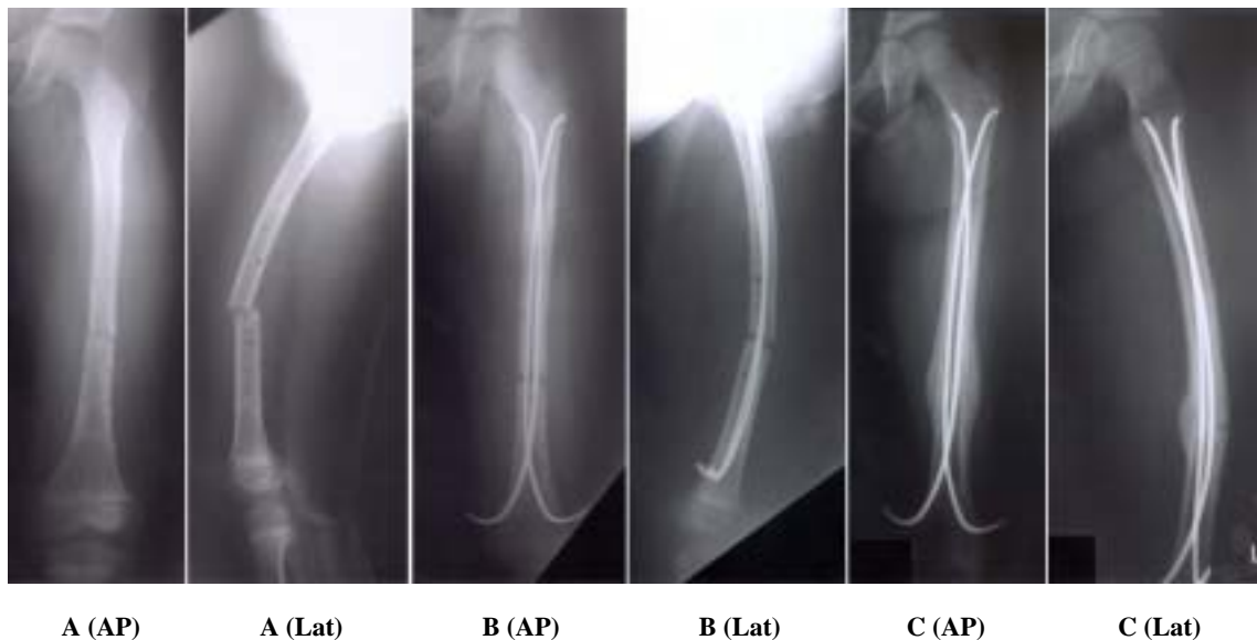
Fig. 1. Serial radiograph of 7 year old boy treated by Nancy nail. 1A. Preoperative AP and Lateral radiogram shows refracture of the femur at the previous fractured site, on the 3rd days after the removal of External Fixator. 1B. Immediate postoperative radiogram presents two inserted Nancy nails. 1C. Postoperative 3 months follow up radiogram shows well unioned fractured site.

2001 5 2003 5 Nancy 1 가 12 12 , 4 12 7.2 . 8 , 4 . 9 , 3 2 , , 10 . 1 (Fig. 1A~C). 8 (Fig. 1~3), 2 , 2 , 4 (Fig. 3A~C), 5 (Fig. 1, 2), 3 . Nancy 1 가 , 3 3.5 mm , blunt-ended , , , 2 cm 45° , . 4 mm drill