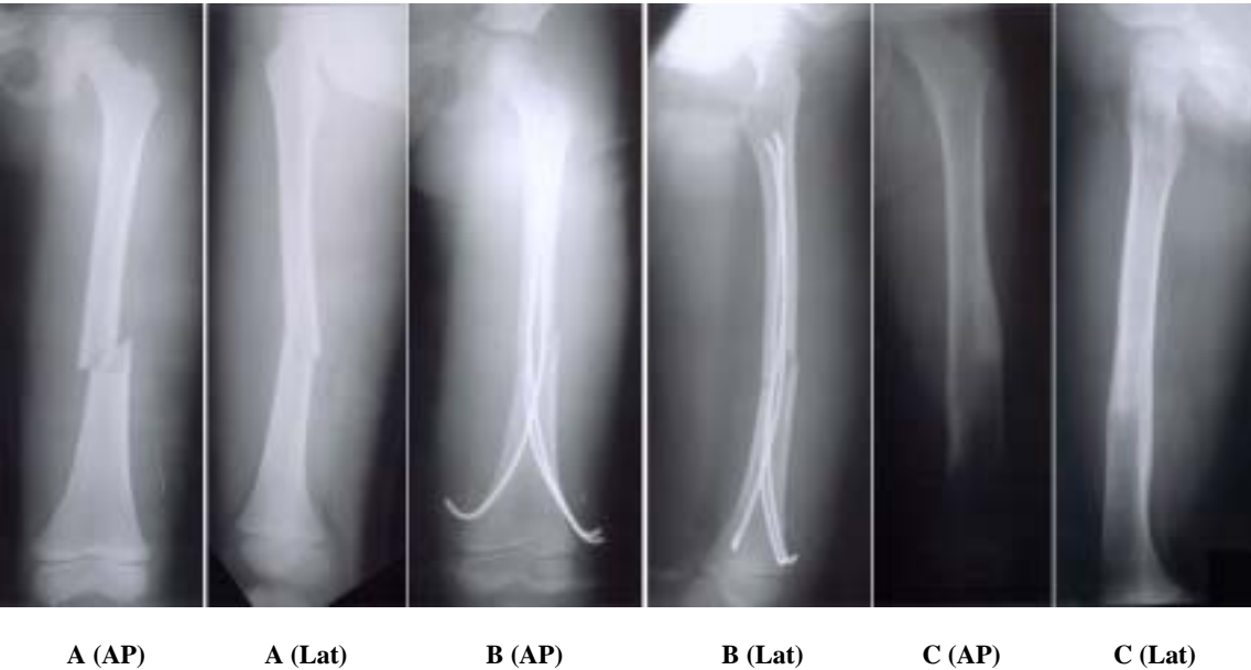
Fig. 2. Serial radiograph of 9 year old boy treated by Nancy nail. 2A. Preoperative AP and Lateral radiogram shows transverse fracture at the middle 1/3 of femur. 2B. Immediate postoperative radiogram presents three inserted nails. 2C. Postoperative 12 months follow up radiogram shows complete union feature.