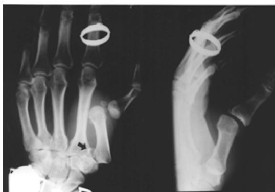
Fig 1. Initial X-ray shows simultaneous dislocation of the metacarpophalangeal and carpometacarpal joint. Chip bone fracture of the 1st metacarpal base is also seen (arrow).