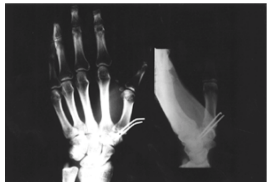
Fig 2. Postoperative X-ray shows well-reduced metacarpophalangeal and carpometacarpal joint with K-wire fixation of carpometacarpal joint.