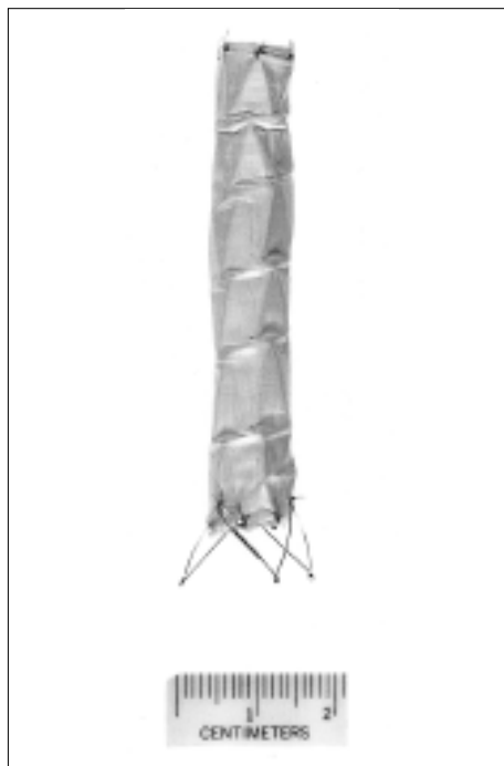
Fig. 1. A spiral Z-stent is covered with a 10-mm-diameter PTFE tube. TIPS tract extending from the portal vein wall to the inferior vena caval orifice of the right hepatic vein was lined with this stent-graft. A single Z-stent "skirt" is connected to the leading end of stent-graft.

A spiral Z-stent, 10 mm in diameter and 5.5 cm long, made of 0.012-inch stainless wire was covered with a 10-mm-diameter thin-walled PTFE tube(Atrium, W. L. Gore, Flagstaff, Ariz.) attached at both ends by a 6-0 polypropylene suture. A single Z-stent "skirt" was connected on the outside with suture, 2 mm beyond the leading end of the graft(Fig. 1). When the covered stent was compressed and pushed through the 10-F delivery sheath, the skirt was deployed and allowed to expand well within the main portal vein while the rest of the graft was still compressed. Under fluoroscopic guidance, retraction of the entire delivery system caused the skirt to contract at the portal vein wall, the remainder of the covered spiral Z-stent was then released by further sheath withdrawal. In this manner the entire TIPS tract from the portal vein wall, through the right hepatic vein