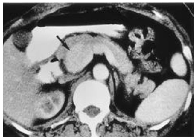
Fig. 3. 46-year-old woman with extrahepatic portal vein aneurysm. Portal-venous phase CT scan shows a cystic dilatation of the extrahepatic portal vein at the confluence of the superior mesenteric vein and splenic vein (arrow).